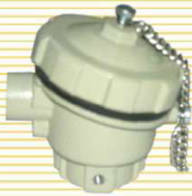
Mini Head 1