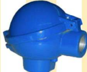
Hinge Type Head