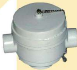
Weather Proof Head(BIG)