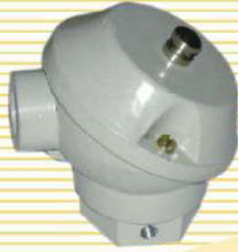
Mini Head 2