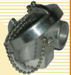
Imported Head 2