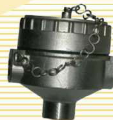
Stainless Steel(SS) Head 2