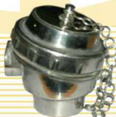
Stainless Steel(SS) Head 1