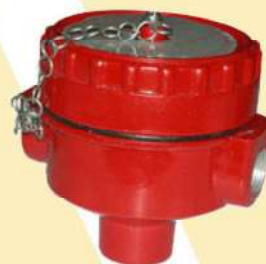
Flame Proof Head 2 (II C APPROVED)