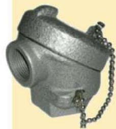
Imported Head 4