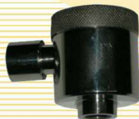
SS Head (SMALL)