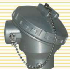
KNE Type Head