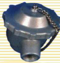
Mini Head 3