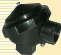
Imported Head 3