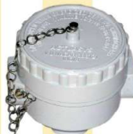
Flame Proof Head 1