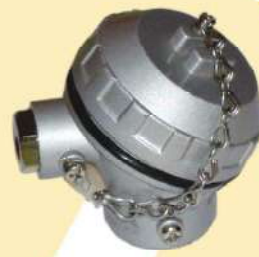
Imported Head 1