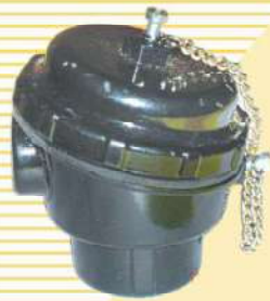
Weather Proof Head