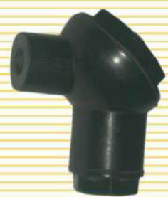
Small Bakelite Head